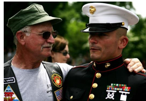
Images of veterans for transparencies or slides