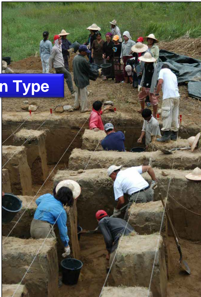
Host Nation Support