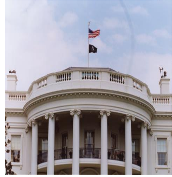
POW/MIA Flag flying over White House – National POW/MIA Recognition Day, 1993